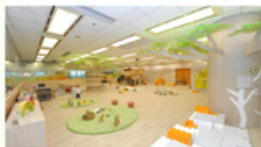
Play in Library