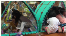
Play in School